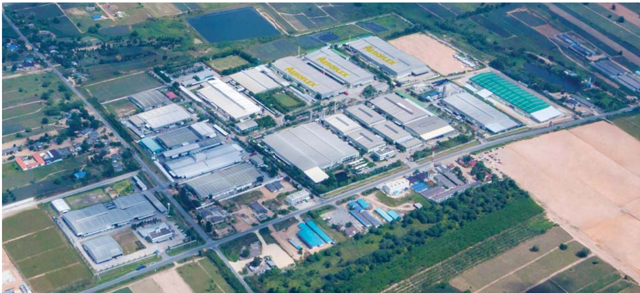
AEROFLEX CO.,LTD [Total area 100,000 m 2 ]

For more information, please contact your local distributor.